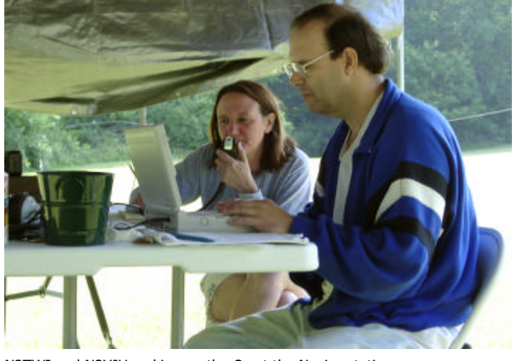
N2TWI and N2YJU racking up the Qs at the Novice station.