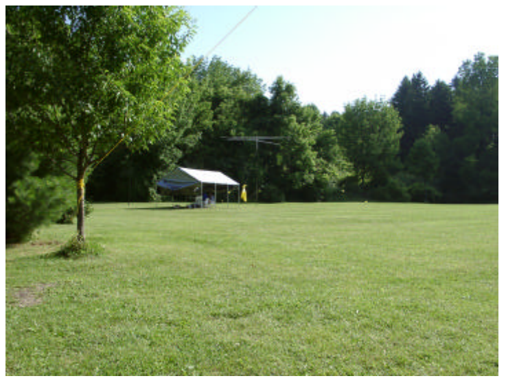
This is why it's called Field Day: the Novice station in the field. Note the slightly askew element on the 10m beam...a casualty of attempting to pull up a push-up mast!