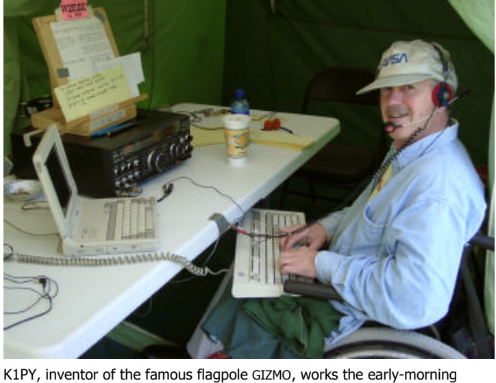
K1PY, inventor of the famous flagpole GIZMO, works the early-morning pileup in the SSB tent.