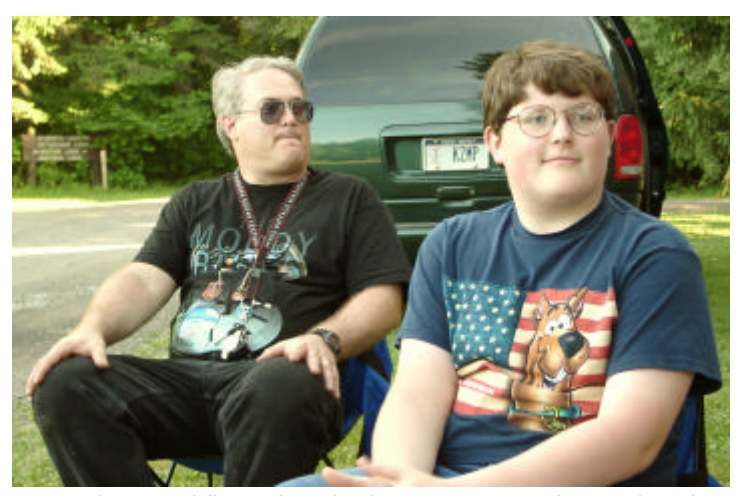
AE2T and son carefully watching the dinner setup proceedings...asking the age-old question, "Did they get enough?"