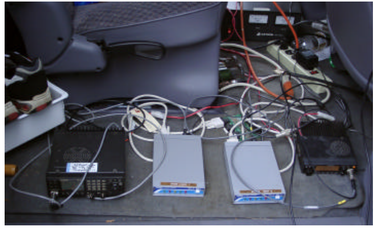
The NG2P packet node demo setup: 2 TNCs, 2 radios, 2 antennas, 2 terminals, miles of wire. And they call this "wireless?" \,