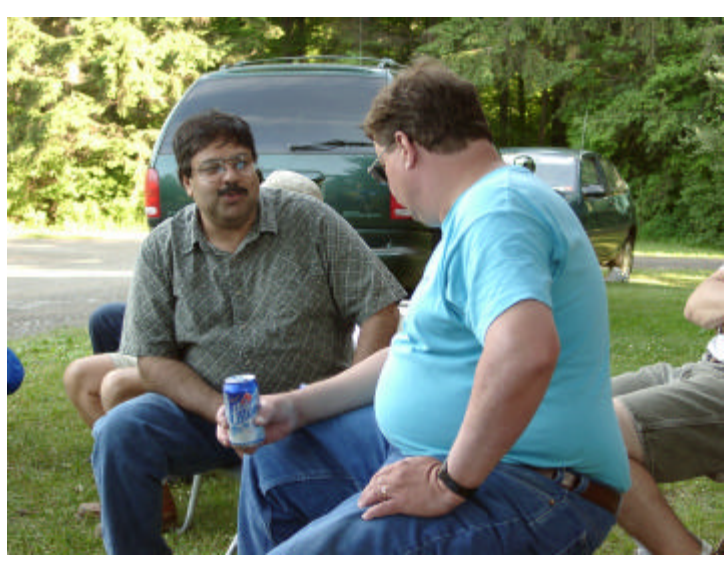
Setup isn't so bad if you take a break with a "cold 807" from time to time. N2CK and N2RD enjoy the shade and a respite from the antenna raising action in the field.