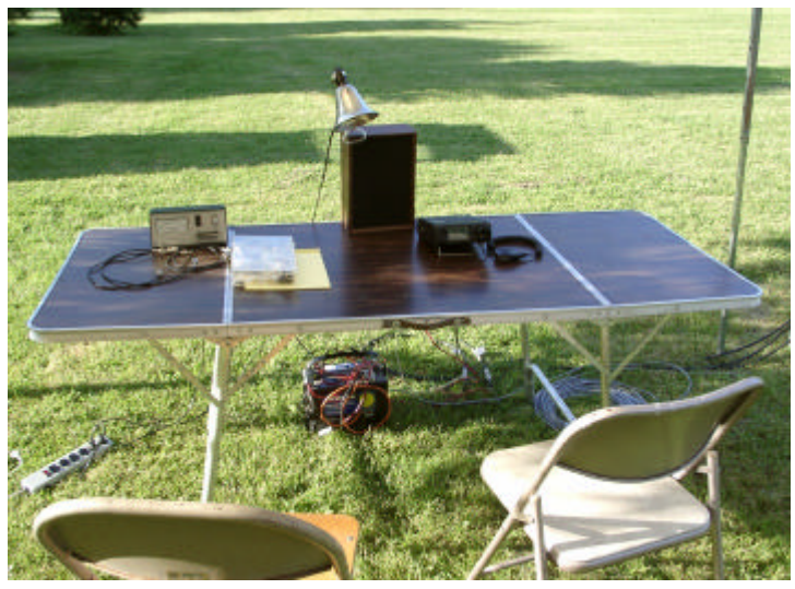
Come on! How hard could it be to set this station up? Ah remember, what you don't see is the antenna: N2OPW's VHF stack on a tower, with rotor. The VHF tent is ready to QSO!