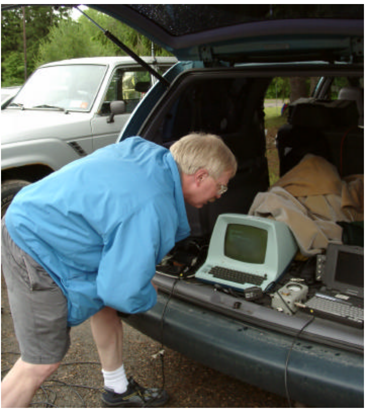
"Hit any key!" NG2P in action during the packet demo.