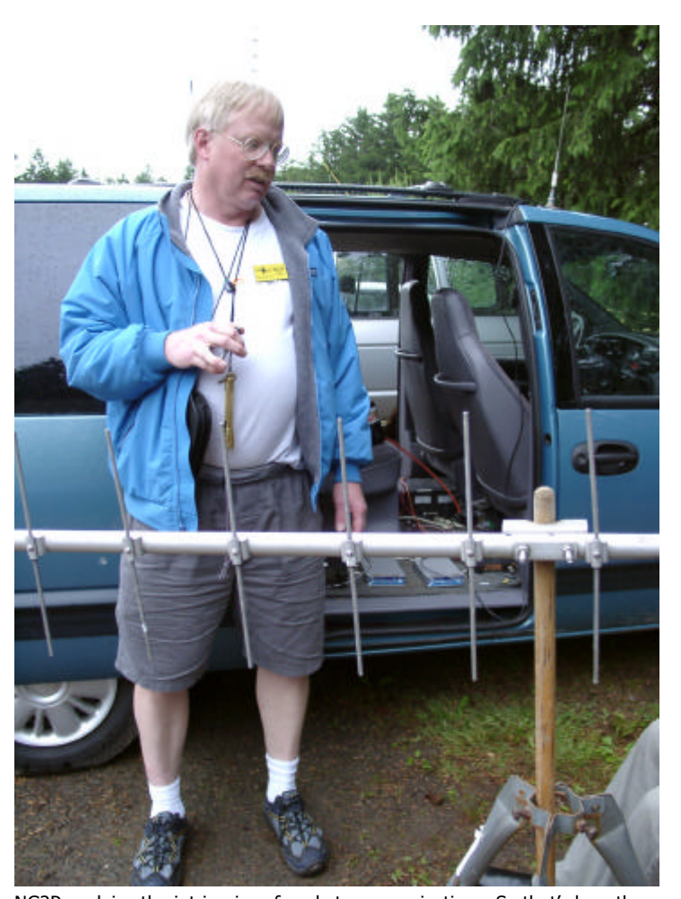
NG2P explains the intricacies of packet communications. So that's how the Cluster works? I always wondered!