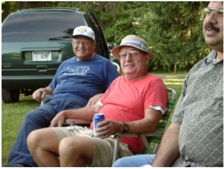
K2MP, K2SKO, and N2RD enjoy a rest and a cold one after lifiting the big generator into place.