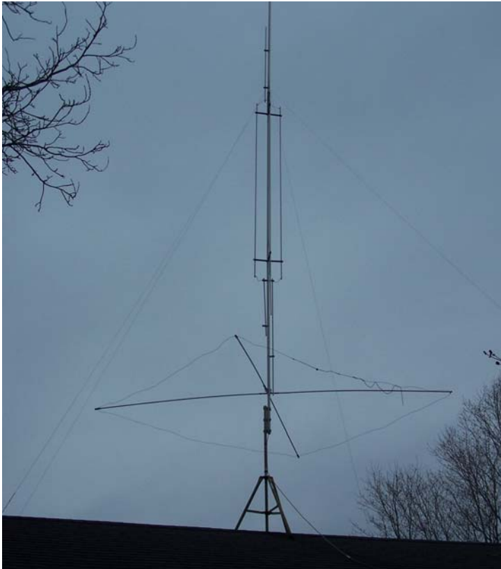
N2CK vertical: The Gap Titan on his garage roof gives Dave 10-80m coverage, including the WARC bands, and low-angle takeoff for DX.