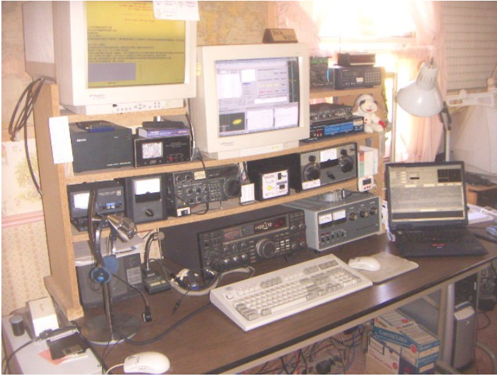
Rick, W1TY: Rick's optimized RTTY setup includes three separate decoders for RTTY, an IC765 and FL2100 amp. Soon to be online is a new, homebrew, solid state Class E amp capable of delivering 2kW in RTTY.

As the saying goes, "A picture is worth a thousand words." With this in mind, we continue our photographic tour of RDXA member's shacks, antenna farms, and the like. Ed.