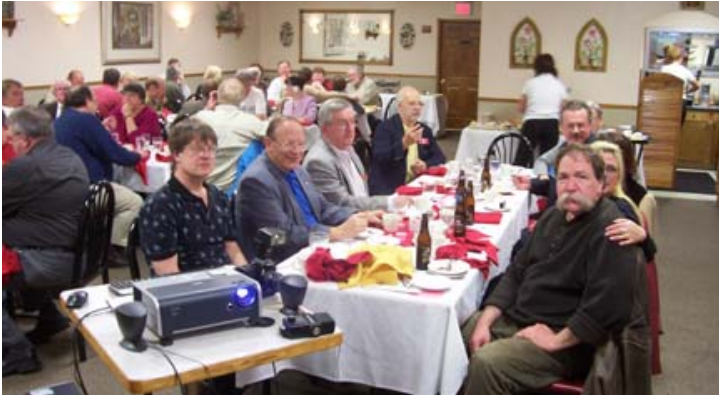
The assembled Club members and guests.