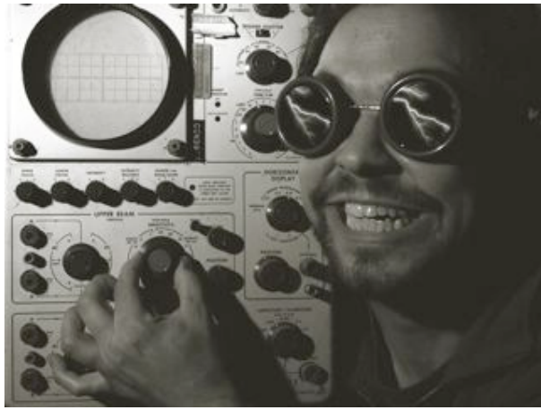
Your new editor