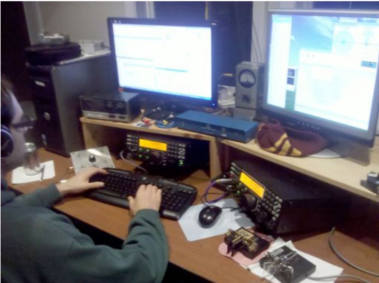
K2TJ – Running SO2R at W2FU during the ARRL DX CW Contest