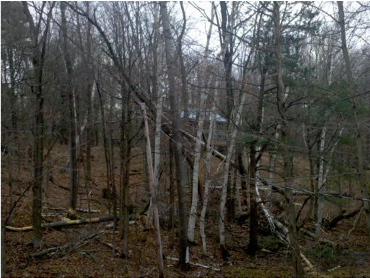
Tree leaning over power lines at K2NNY, been that way since SSB Sweepstakes