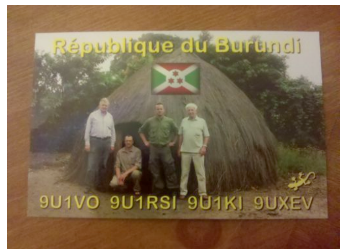
9U1VO – QSL received by K2DB via the buro