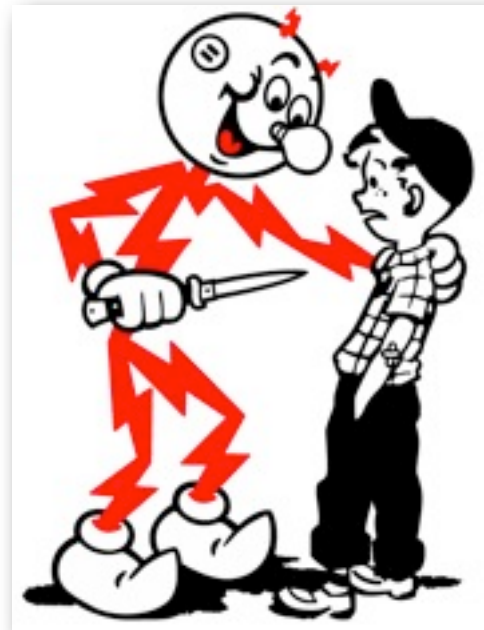
Always remember to operate safely. Mr. Volt doesn't like to be messed with.

I was born and raised in Camp Hill, Pennsylvania. It was in 1992 I earned my Technician license as N3LZG, upgrading to General shortly afterward. After moving to upstate New York for my education, I had remained off the air until 2010, when I upgraded to Extra. I am now into my second year as newsletter editor and look forward to disseminating your articles, documents and submissions for the upcoming DX/contesting year.