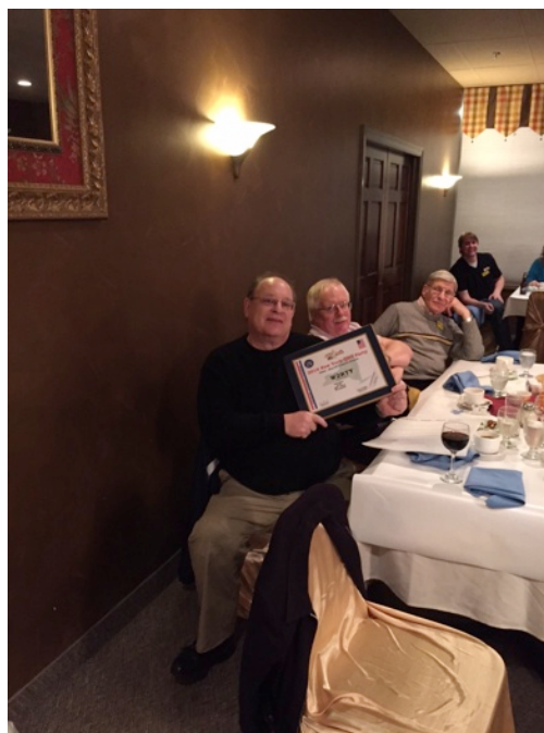
W1TY - NY Phone QRP