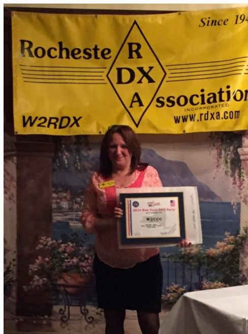
Gayle, N2TWI (for W2CCC) NY Multi One RDXA Worked Most States