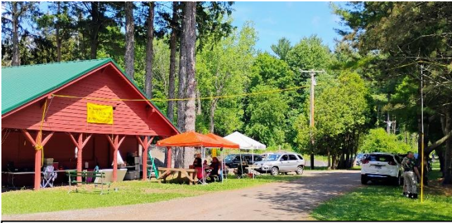
This year we ran the wires over the road