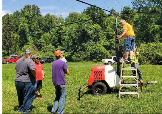
Hexbeam going up on K2GC's generator trailer