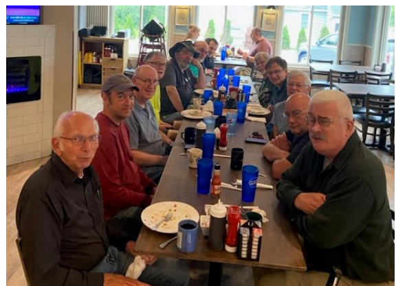
Friday breakfast at Mama Lor's on Lake Rd